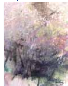
Heaven and Earth 62" x 46"